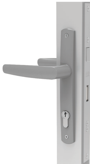
DS1600 Hinged Door Lock

EPEC can be used in conjunction with these following Doric hardware: