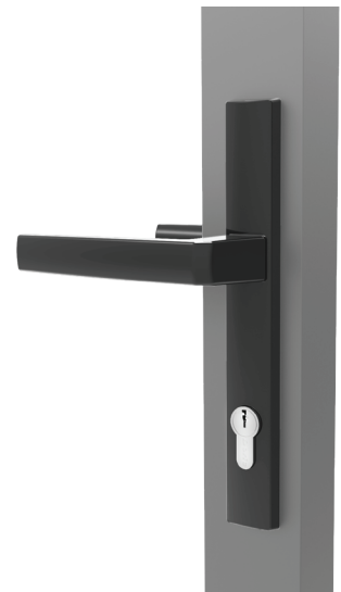
DS1650 Hinged Door Lock